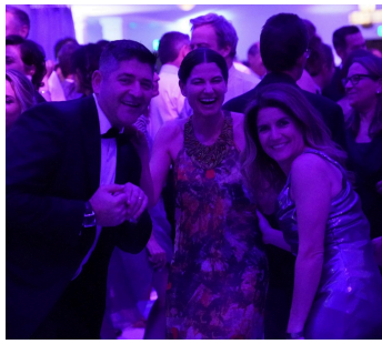
Photo from LILA's 40th Anniversary Gala