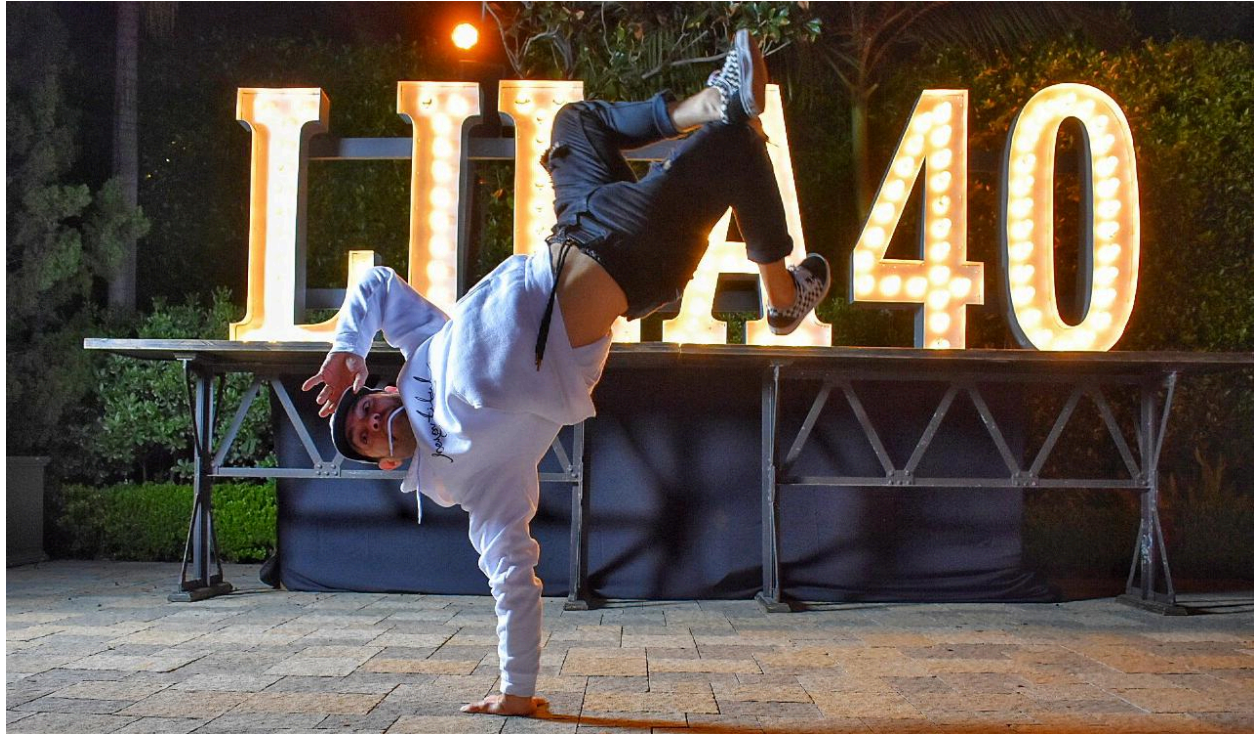
Photo from LILA's 40th Anniversary Gala