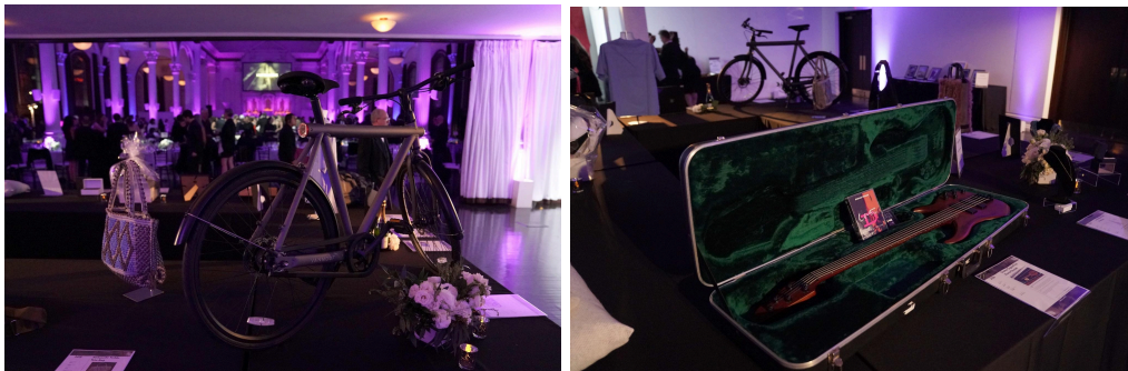
40th LILA Gala - Silent Auction

We invite you to join us in building LILA's endowment while promoting your business, product or services to our community - a very engaged audience.